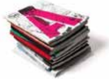
Magazines, catalogs, and telephone books