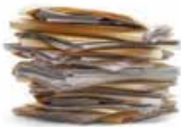
Office paper, junk mail, folders