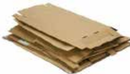
Cardboard (flattened to fit in your recycling bin)