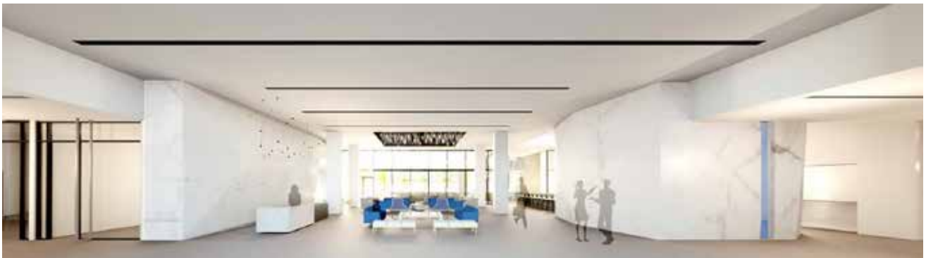
MAIN ENTRY VIEW WATT PLAZA