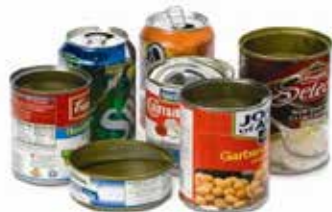
Aluminum cans, steel & tin cans

NO FOOD! ALL RECYCLABLES THAT HAVE HAD FOOD ON THEM MUST BE RINSED!