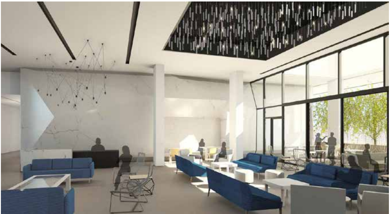
LOBBY LOUNGE VIEW WATT PLAZA