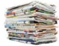
Newspaper, including inserts